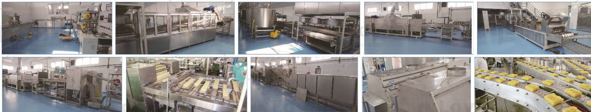
生产线平面图展示 Production Line Floor Plan