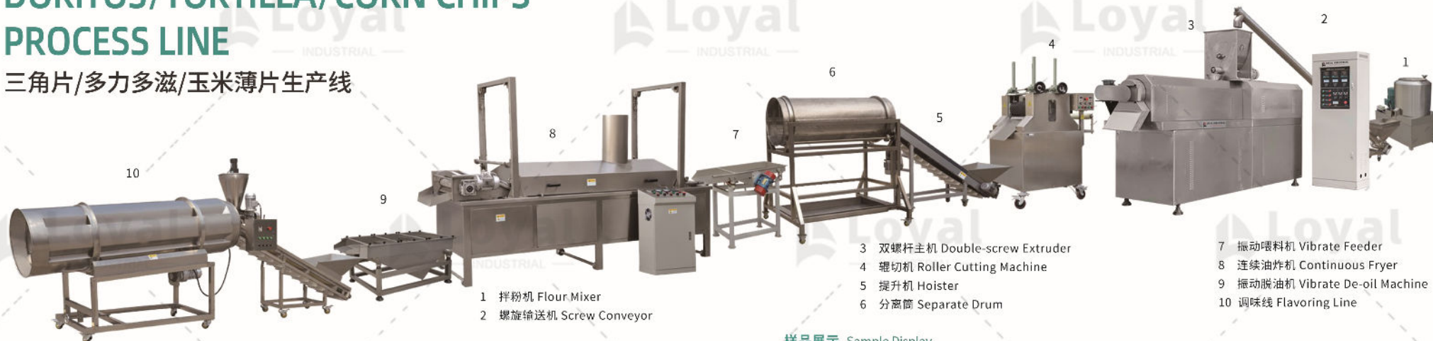
1 拌粉机 Flour Mixer 2 螺旋输送机 Screw Conveyor